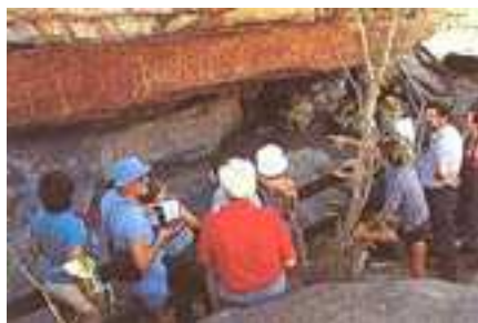
Tourists examine the main gallery of rock art at Ubirr

Groups of Aboriginal people camped in rock shelters around Ubirr to take advantage of the enormous variety of foods available from the East Alligator River, the Nadab floodplain, the woodlands, and the surrounding stone country. The rock overhang of the main gallery provided an area where a family could set up camp. Food items were regularly painted on the back wall, one on top of the other, to pay respect to the particular animal, to ensure future hunting success, or to illustrate a noteworthy catch. Among the animals painted in the main gallery are barramundi, catfish, mullet,