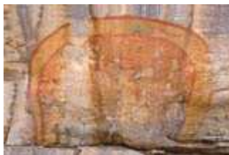
The rainbow serpent

As is common with oral traditions, stories about the rainbow serpent vary from place to place, to reflect differences in environmental and social conditions. In Kakadu, Aboriginal people describe the rainbow serpent as the 'boss lady', all powerful, ever present and usually resting in quiet waterways unless disturbed. Common features of rainbow serpents in this area are that they are generally female, they are associated with water, they will eat anything except flying foxes, and they dislike loud noises. If irritated, they are capable of causing serious natural disasters such as floods or earthquakes.