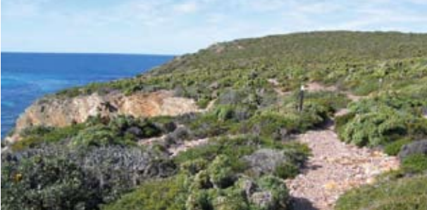
Above from left View towards Hopetoun; Pt Ann Heritage Trail.