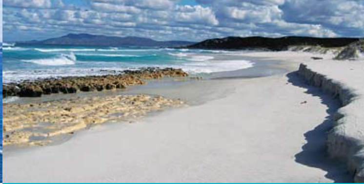
Above Hamersley Beach.

The park is large enough to provide a baseline for evaluating environmental change. Landowners, communities and agencies from the surrounding area work together to manage land use and minimise impacts on this magnificent national park.