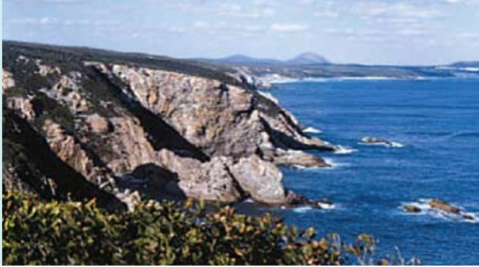
Above View from near Quoin Head.

Fitzgerald River National Park covers an area of 329,039 hectares and lies on the central south coast of Western Australia, between the towns of Bremer Bay and Hopetoun, 420 kilometres south-east of Perth.