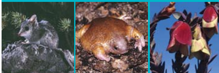
Above from left Dunnart, turtle frog and Quaalup bell.

When driving in the park, it is essential to keep to established roads and tracks and obey all 'ROAD CLOSED' signs. Bush walkers can help by cleaning mud and soil from their boots before entering a park or reserve. By washing the tyres and underbody of your car before and after a trip to a park or reserve, you can help preserve WA's natural areas.