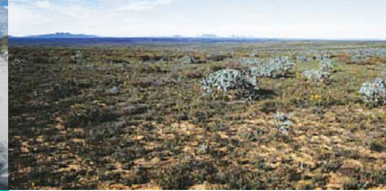
Above Fitzgerald River National Park.