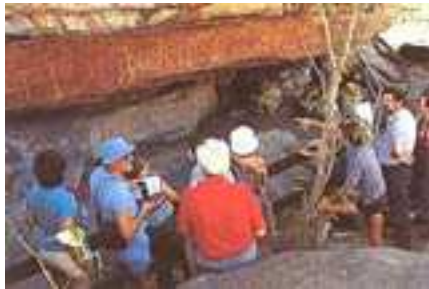
Tourists examine the main gallery of rock art at Ubirr

Groups of Aboriginal people camped in rock shelters around Ubirr to take advantage of the enormous variety of foods available from the East Alligator River, the Nadab floodplain, the woodlands, and the surrounding stone country. The rock overhang of the main gallery provided an area where a family could set up camp. Food items were regularly painted on the back wall, one on top of the other, to pay respect to the particular animal, to ensure future hunting success, or to illustrate a noteworthy catch. Among the animals painted in the main gallery are barramundi, catfish, mullet,